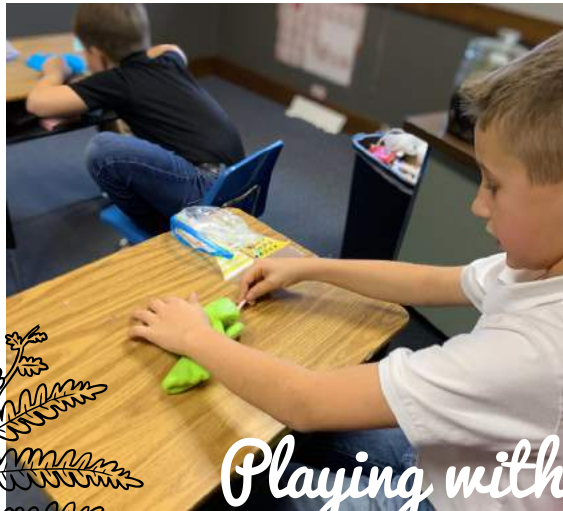
Playing with slime we made