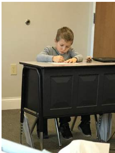
8th graders aren't as big as they used to be