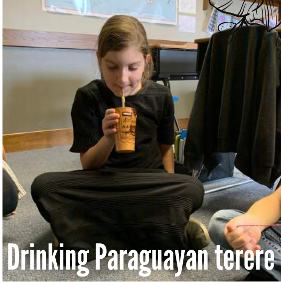
Drinking Paraguayan terere