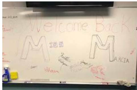
I came back to this lovely note on the board!