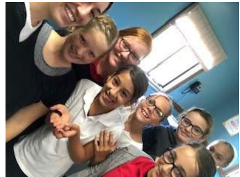
The girls with their pet caterpillars.