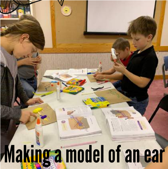
Making a model of an ear