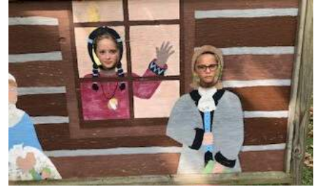
Field trip to Gnadenhutten and Shoenbrunn