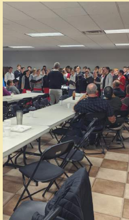
PASTOR'S APPRECIATION BREAKFAST