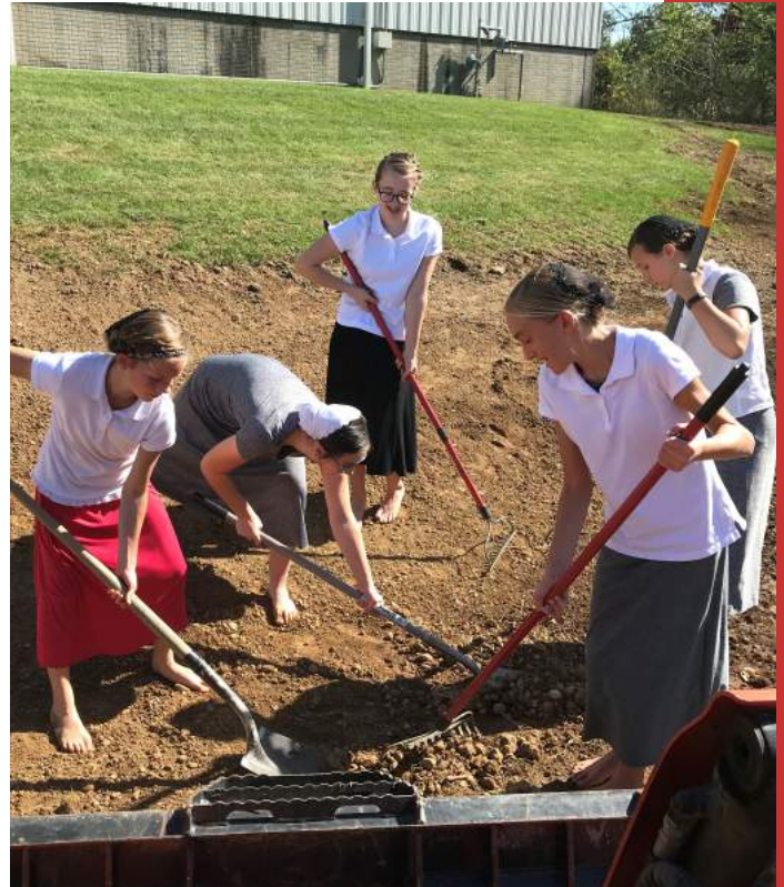
hard work is best observed from a skidloader seat