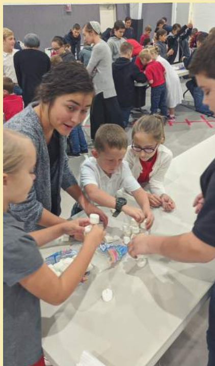
MARSHMALLOW BUILDING CONTEST